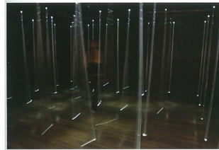
Above: Ceremony , an installation by Kearns Mancini Architects, is composed of light, transparency and memory. Illuminated, clear crystal rods and sheets of clear acetate provide a framework for visitors' descriptions of sacred spaces.

contains an image or video of a space that's sacred to a person in the Taylor Smyth office. A large map with backlit LED lights indicated the featured spaces. Sacred Space runs at Harbourfront's York Quay Centre until Sept. 7.