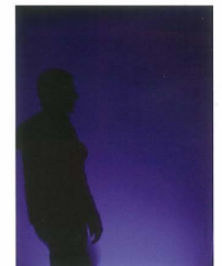
Above in Taylor Smyth Architects' installation, suspended columns hold backlit view boxes. Right in Levitt Goodman Architects' Twilight , a six-minute cycle of shifting light distills the 24-hour cycle of the sky.

(Click on the image for published article)